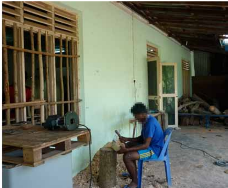
Prisoners at work - Asseyri Prison, Himmafushi