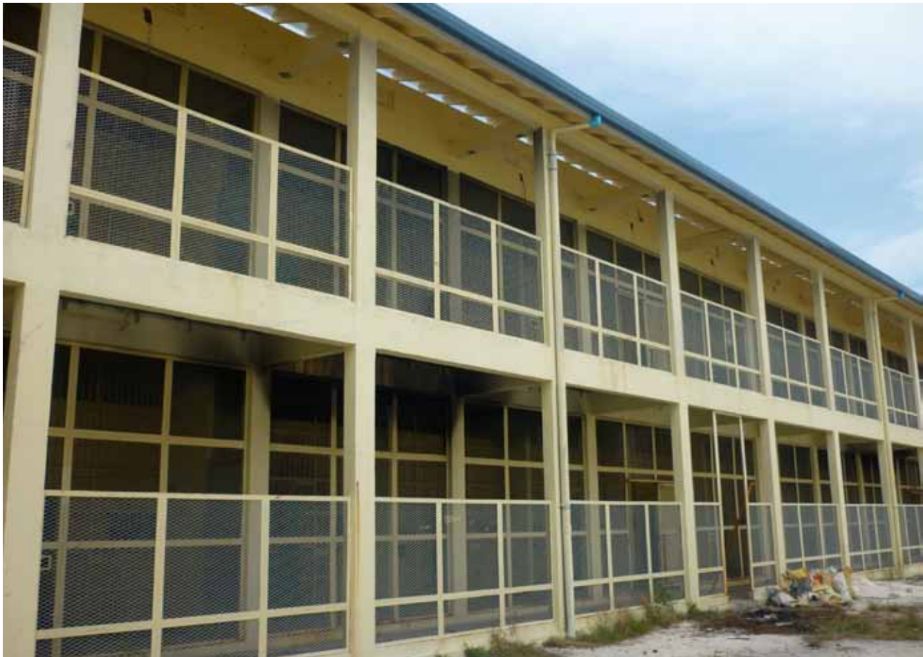
Infamous U2 - Maafushi Prison