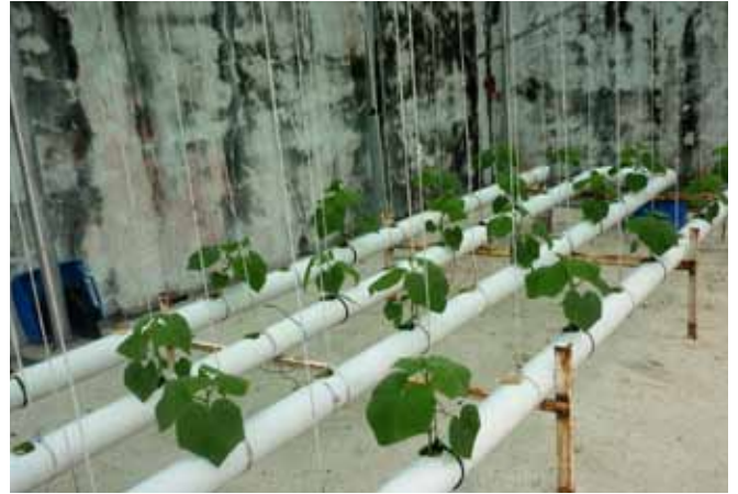
Prisoners at work - Asseyri Prison, Himmafushi