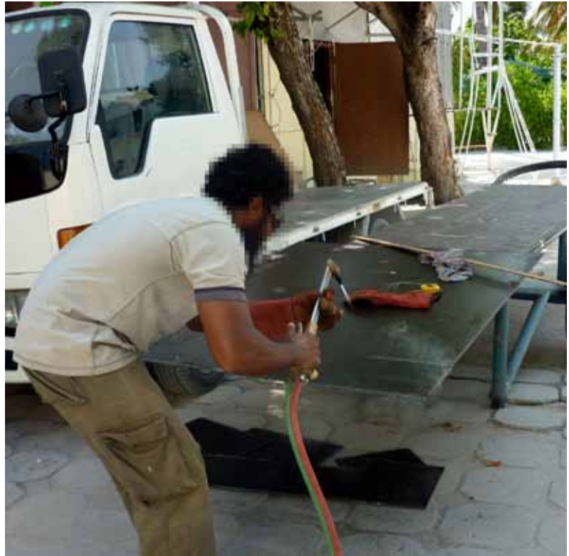
Prisoner at work - Maafushi Prison

Stage 3 - Training for experience: Once the prisoner has acquired a qualification (foreigners and women included) they will be qualified to apply for a job within the prison industry. The first 3 to 6 months after the qualification they would be required to remain as trainees and would be on voluntary employment. Once they have completed this stage they can be employed with salary in the prison industry.