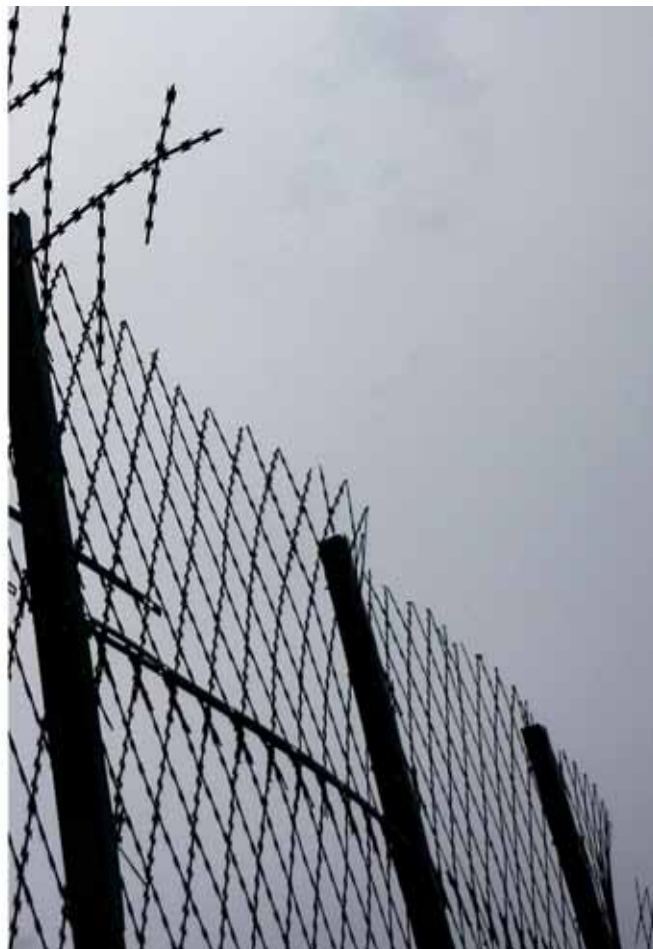
Medical Centre (top) and Unit 2 - Maafushi Prison