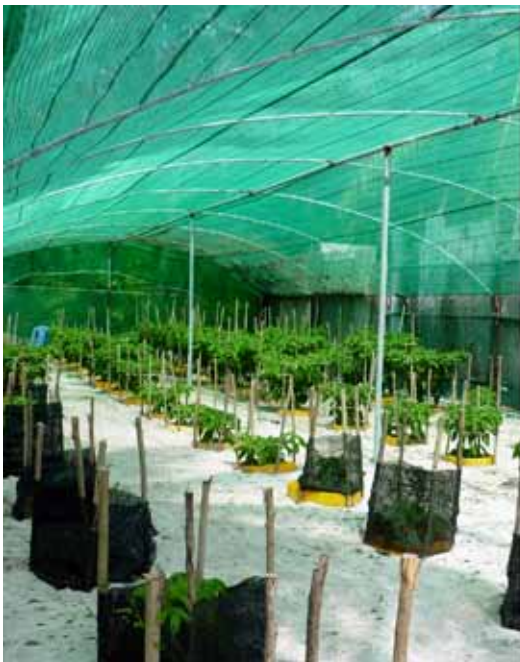
Asseyri Prison - Himmafushi