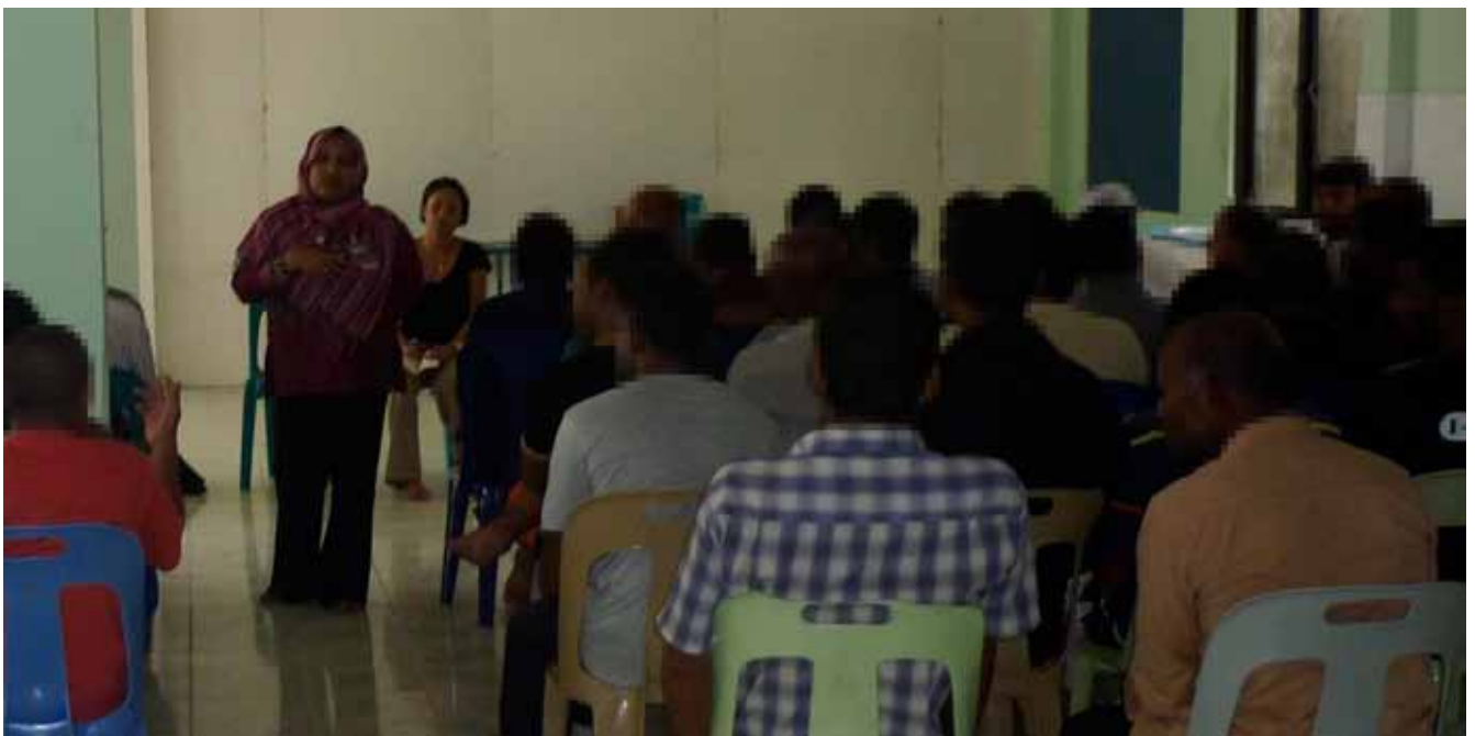
Consultation meeting with prisoners - Asseyri prison Himmafushi

RSA methodology uses multiple indicators and data sources, including both quantitative and qualitative data, and allows utilization of existing data. Data triangulation is used for verification and to crosscheck of conclusions to avoid subjective biases about the current situation.